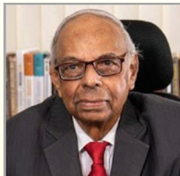
Dr. C. Rangarajan

Former Economic Advisory Council to the Prime Minister , Former Governor, Reserve Bank of India and Chairman, Madras School of Economics